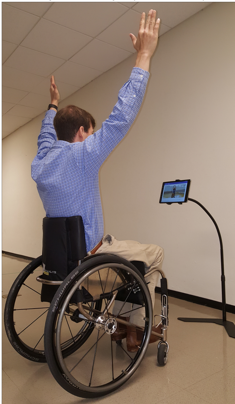
Figure 2. Example of an individual following an exercise routine through a computer tablet mounted to an adjustable stand.