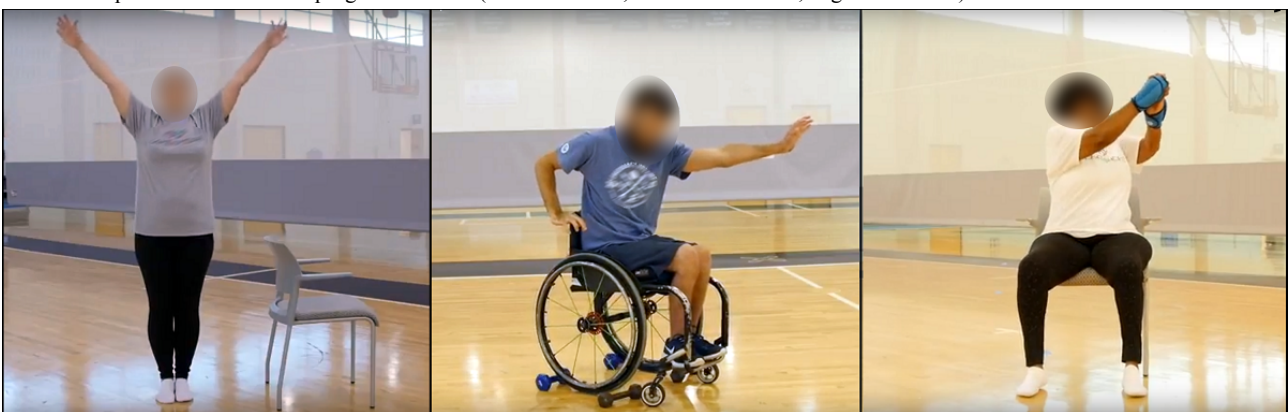
Figure 1. Examples of the 3 different program versions (Left: Version 1; Middle: Version 2; Right: Version 3).

App usability was defined in terms of effectiveness (the ease at which individuals can use the product), efficiency (the speed with which an individual can accurately complete a task), usefulness (the extent a product can enable users to achieve their goals and willingness to use the product), and satisfaction (the users' perceptions and opinions of the product) [8]. Usefulness and satisfaction were explored through qualitative means, whereas effectiveness and efficiency were examined through quantitative metrics.