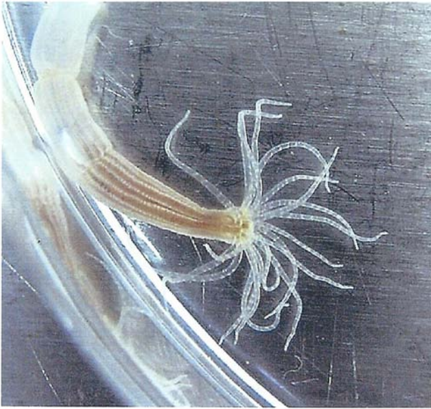
Figure 1. The sea anemone anthozoan cnidarian Nematostella vectensis possesses several ontogenetic and cell survival pathways dominant among them the WNT and NF- \kappa B/STAT enzyme-catalyzed sequential reactions (7,125). The copyright holder Creative Commons Attribution-Share Alike 3.0 License granted permission for the reproduction of this document under the terms GNU Free Documentation License.

proto-oncogene. When constitutively activated, it induces B cell malignant lymphomas in the mediastinum and elsewhere. It is highly active in the Reed-Sternberg cells of Hodgkin's lymphoma.