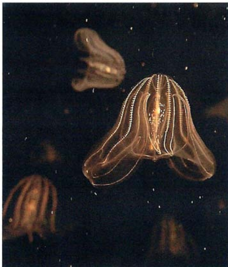
Figure 3. The ctenophore sea walnut Mnemiopsis leidyi from the New England Aquarium, Boston, MA, by Steven G. Johnson. Wikimedia Commons freely licensed media file repository. Creative Common Attribution Share Alike 3.0 License. GNU Free Documentation License Version 1.2. The ctenophore genome's WNT pathway is physiologically defective in that, its cytoplasmic ' \beta -catenin destructive pathway' allows the transfer of \beta -catenin into the nucleus for the activation of the promoters of cell cycle-dependent kinase genes, and lacks their natural inhibitors Dickkopf, that are to be acquired later in evolution.

algae gained protection against cnidarian host cell lysosomes. Intolerant (symbiosis-free) host cells mobilized the ancient MAMP-PRR interaction (microbe-associated molecular pattern; pattern recognition receptor) (10). In this interaction, host cells release lectins that bind cell surface glycans (galactose; mannose) of the invaders.