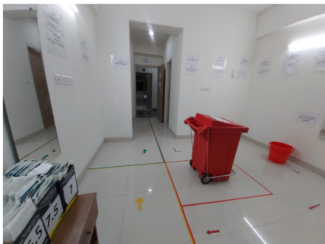
Figure 3 Design of the doffing room.

There was considerable awareness and interest in COVID-19 among staff due to social media coverage.