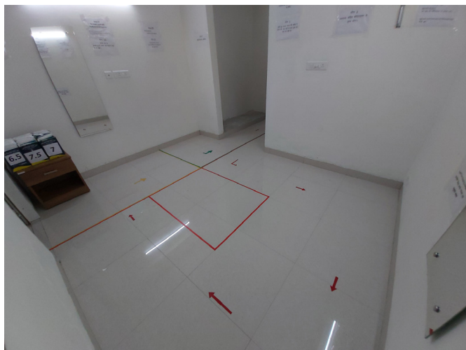
Figure 2 Layout of the floor in the doffing room.

We used the 5S tool to set up and sustain the donning and doffing areas (table 3). We created a checklist for the donning and doffing areas (table 4).