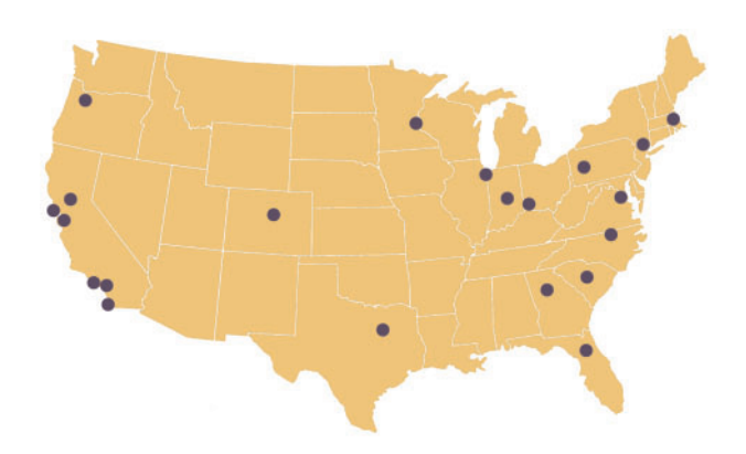
Figure 2. Locations of sites in the Accrual to Clinical Trials network.

For operational efficiency, there are three separate networks that include test, stage, and production networks. The test network, comprising of four sites, is used for testing software and ontology upgrades. The stage network consists of new sites that are connecting to the network for the first time and provides a mechanism to evaluate a site's readiness and troubleshoot technical, ontology, and