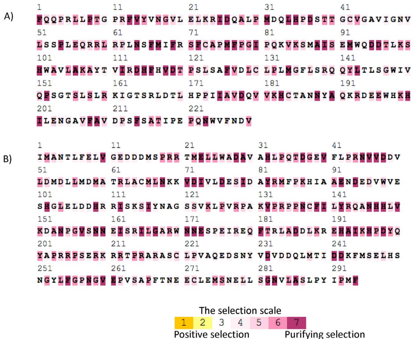
Figure 2. Color coded Selecton Results for a) MAT1-1 and b) MAT1-2 sequences of Penicillium roqueforti . Amino acids sites under purifying selection are colored in purple. Darker purple colors indicate stronger purifying selection and values of \omega closer to 0. More than 70% of the sites for MAT1-1 and 50% for MAT1-2 are evolving under strong purifying selection. doi:10.1371/journal.pone.0049665.g002

type idiomorphs were found in separate individuals of P. roqueforti as is generally the case for heterothallic species. The MAT1-1 and MAT1-2 idiomorphs in P. roqueforti did not show evidence of loss-of-function mutations and they seemed to evolve under strong purifying selection as expected in sexual species [17,23]. While the ratio of the two MAT idiomorphs was found to be balanced amongst strains belonging to public culture collections and those used as inoculum in cheese production, individuals carrying the MAT1-2 idiomorph were overrepresented in the “F” strains directly isolated from blue cheeses. A 1:1 ratio of mating types is considered as strong evidence that sexual reproduction is occurring in fungal populations, as drift is expected to drive one mating type to extinction in asexual species [59–63]. Balanced frequencies of mating types have been found in populations of species that had long been considered to be asexual before sex was successfully induced in lab conditions, e.g. in Aspergillus fumigatus [64]. A strong deviation from this 1:1 ratio has however been observed in some sexual species such as Cryptococcus neoformans [65]. Several reasons can account for a skewed mating type ratio in