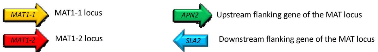
Figure 1. Schematic illustration of the Mating-type locus and the flanking of Penicillium roqueforti FM 164 (MAT1-2 strain) and its close relative P. chrysogenum Wisconsin 54-1255 (MAT1-1 strain). The transcriptional direction of the genes is indicated by an arrow. As the Wisconsin strain is a MAT1-1 strain, we identified the MAT1-2 gene in another P. chrysogenum strain (AM904545). Genes represented in both species by same colors show a nucleotide identity >80%. doi:10.1371/journal.pone.0049665.g001

not detect any footprints of positive selection in the rid gene. The \omega values per amino acid position suggest that recent evolution of the rid gene was shaped by purifying selection in a large proportion of the sites ( \omega < 0.1 ).