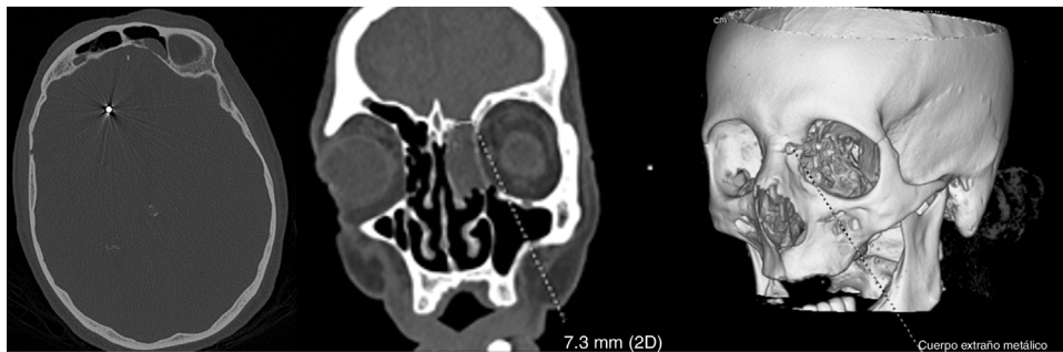
Figure 1 Head CT scan of the first patient showing metallic artefacts compatible with bird shot and loss of bone continuity at the left frontal sinus.