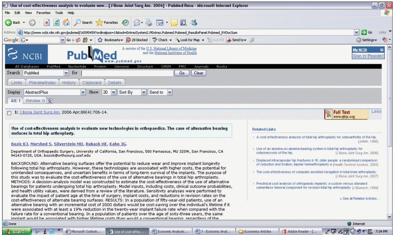
Figure 3: Relevant article