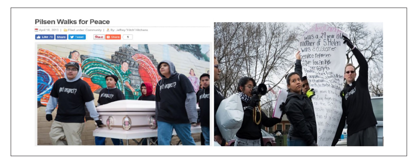
Photo 1. Context 1: Photo evidence of strong community and parish relationship. Photo credits: Jeffrey "Hitch" Hitchens from: www.thegatenewspaper.com Permissions for reprint obtained.

Observational data, reflective memos, and transcripts from archived video data indicate that his homilies/sermons on the topic of IPV/A were straightforward, research-based, and engaging, but also compassionate. The homilies invite people who have perpetrated or experienced violence and abuse to seek help. Indeed, two of the focus group participants cited the reason they sought help from TMG from hearing a sermon on DV that was given by "a St. Pius V priest". As one participant stated