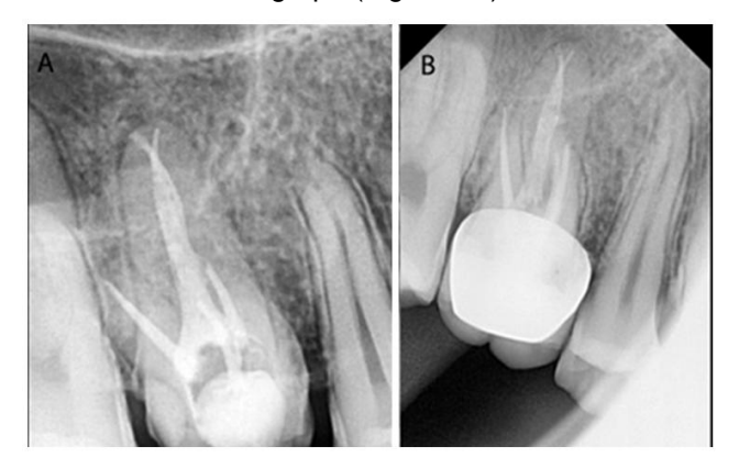
Figure 3: After the procedure; A) Immediate-postoperative image; B) 6-months-follow-up radiograph

After 6 months of following up, the tooth #16 was asymptomatic as well as complete healing was shown on the radiograph (Figure 3B).