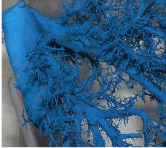
Figure 2. Vascular cast of HIVC.