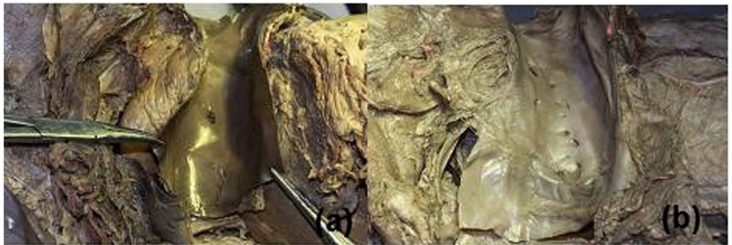
Figure 3. The number of small veins draining into HIVC: 2 (a); 20 (b).

with diameter greater than 1 mm were recorded in the 32 liver specimens. Of these small veins, 32 (11.4%) were located in the upper 1/3 of the HIVC, 121 (43.1%) were located in the middle 1/3 of the HIVC, and 128 (45.6%) were located in the lower 1/3 of the HIVC.