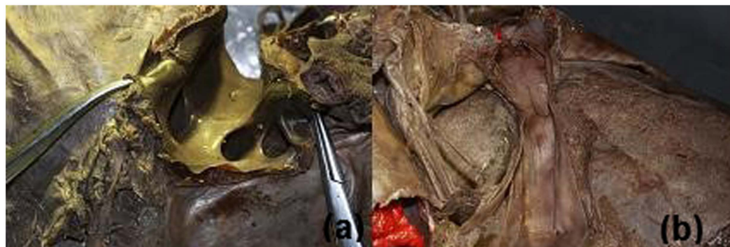
Figure 1. The superior opening of the retrohepatic tunnel (diaphragmatic view) (a); the inferior opening of the retrohepatic tunnel (back view) (b).