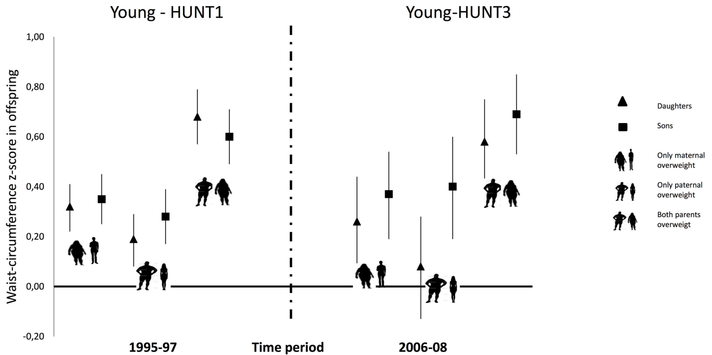
Fig 3. Associations in waist circumference. Associations between parental waist circumference-based overweight (related to WHO's cut-off level) and offspring's waist circumference z-scores at two time points (1995–97 and 2006–08), with both parents being overweight, only mothers being overweight and only fathers being overweight, compared to both parents being normal weight.