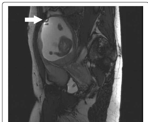
Fig. 1 T2-weighted pelvic MRI at 17 weeks gestational age, with thin left uterine horn myometrial thickness (indicated with a white arrow), with a known amniotic band

Given these imaging findings and the patient’s ongoing pain, the decision was made to proceed with diagnostic