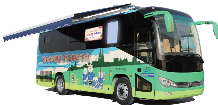
FIGURE 1. The exterior of a vaccination vehicle.

Vaccination vehicles are used by immunization clinics to conduct onsite vaccination in their respective jurisdictions. Vehicles are parked in accessible locations and vaccination workers from an immunization clinic can rapidly start providing services. People seeking vaccination scan a Quick Response (QR) code to get a wait-list number. All vaccination data are recorded in the Immunization Information System of the local immunization clinic and are submitted to the Immunization Information System of the provincial CDC and relayed to the National Immunization Information System of China CDC — all in near real time. After vaccination, there is a required 30-minute observation period outside of the vehicle, after which