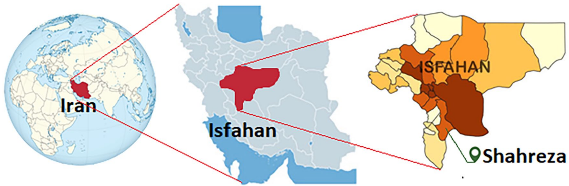
Figure 1. Geographical location of Shahreza in Iran.