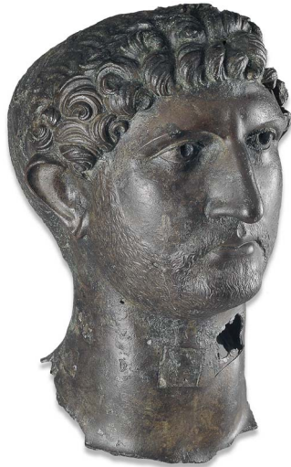
Figure 2: A sculpture of the Roman Emperor Hadrian, located at the British Museum (Asset number 33340001).

[3, 7–10]. However, there is still much controversy regarding its clinical relevance and predictive value. A study by Wang et al. that included 558 patients demonstrated that Frank's sign was independently associated with a risk of coronary artery disease [11] supported by a more recent single-blind cross-sectional study that included 1000 patients. Frank's sign showed a significant association with cardiovascular events with reported sensitivity of 43% and specificity of 70% [12] (Rodríguez-Lopez). Other studies, however, show a weaker association [13].