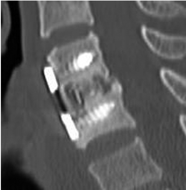
Fig. 1. Illustrative case of a 58-year-old woman with a herniated disc at C5-6 and radicular pain refractory to conservative treatment. An anterior cervical discectomy and fusion was performed using a PEEK spacer filled with osteoconductive \beta -TCP/collagen putty reconstituted with bone marrow aspirate from the adjacent vertebral body. At 6 months, a sagittal reconstruction CT scan demonstrates bridging bone in the PEEK spacer.

vices in New Jersey led to wide media coverage and subsequent public apprehension regarding allograft.