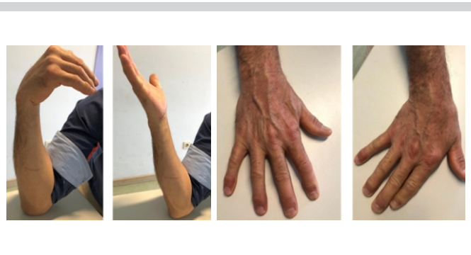
Figure 4: Range of motion 12 months after surgery.