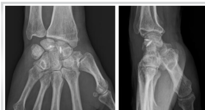
Figure 5: Radiographs 12 months post-operative. The scaphoid maintains reduction, and fracture of the radial styloid shows signs of union with anatomic reduction.

Correct anatomic reduction can be difficult with closed reduction methods, and incorrect alignment may predispose to