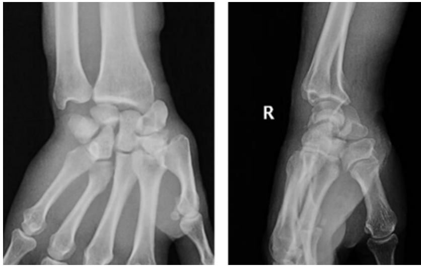
Figure 1: Anteroposterior (a) and lateral (b) views of the right wrist 6 weeks following injury: Scaphoid partial dislocation with widening of the scapholunate gap and proximal migration of the capitate.