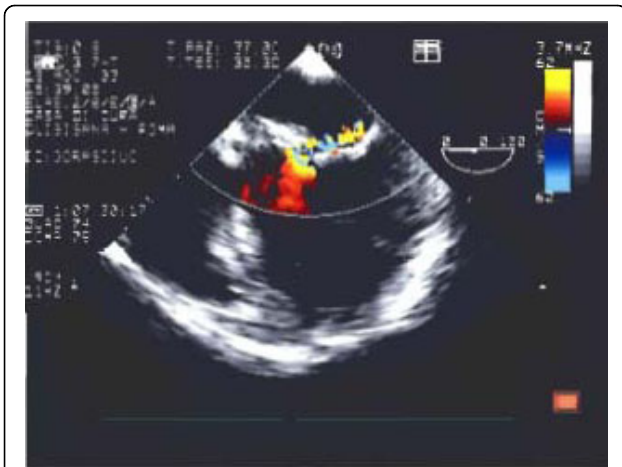
Figure 2 Transesophageal echocardiographic view of mitral valve: moderate-severe mitral regurgitation with jet originating centrally and directed towards lateral wall of the left atrium is seen.

Echocardiography is the first choice technique in the evaluation of suspected or known mitral valve congenital abnormalities, providing useful information about valve anatomical and morphological details, mechanism of MR and its quantitative evaluation.