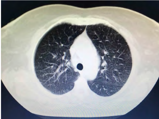
FIGURE 3: Pulmonary involvement. Chest computed tomograph findings. Diffuse bilateral distribution of multiple centrilobular nodules and bronchial wall thickness