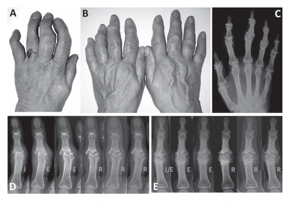
Figure 1 Clinical appearance of erosive osteoarthritis of the interphalangeal finger joints is illustrated in (A) where erosive progression and subsequent remodelling caused functional inability of the second, third and fifth digit, and in (B) where almost all interphalangeal joints of both hands were affected and disabled. Remodelling of the interphalangeal joints in (B) after the erosive process is shown on the corresponding radiograph (C). Typically, metacarpophalangeal joints are spared in this condition. (D and E) Erosive progression and subsequent remodelling in two different proximal interphalangeal (PIP) joints is shown in a series of radiographic images taken at 6-month intervals. PIP joints in which the synovial joint space has disappeared ('J' phase) pass through the erosive E' phase and eventually remodel ('R').

Primary endpoints were the control of structural damage on radiography. Therefore, posteroanterior radiographs of the