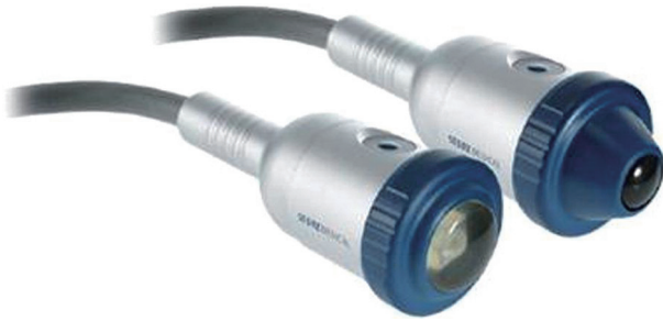
Figure 1 Storz Duolith SD1 ESWT system.