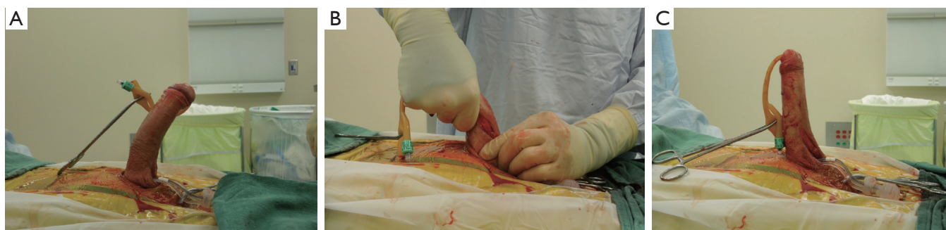
Figure 6 IPP placement with penile remodeling.

to achieve maximal correction but runs the risk of possible urethral injury [see Figure 6 below]. IPP implantation with plication utilizes one of the aforementioned “dot” procedures before prosthesis implantation. Finally, IPP implantation with grafting is only indicated for severe persistent curvature >30^\circ with severe indentation or penile shortening.