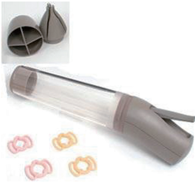
Figure 3 Osbon ErecAid vacuum therapy system.

ErecAid vacuum pump for a twelve-week period [(21), see Figure 3 below].