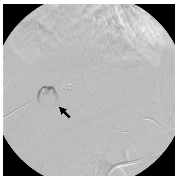
Figure 2 US-guided thrombin injection therapy for an iatrogenic hepatic artery pseudoaneurysm with 21G needle (arrow).

He underwent a right hepatectomy 30 days after the procedure, and his postoperative course was uneventful.