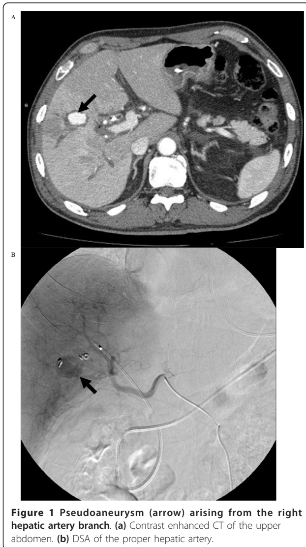
Figure 1 Pseudoaneurysm (arrow) arising from the right hepatic artery branch. (a) Contrast enhanced CT of the upper abdomen. (b) DSA of the proper hepatic artery.

segmental branch of his right hepatic artery: the pseudoaneurysm measured 20 × 15 mm in size with a narrow neck surrounded by hematoma (Figure 1a). Percutaneous transarterial embolization (TAE) of the pseudoaneurysm was considered to be inappropriate, since TAE may cause hepatic infarction because of an already occluded portal vein. Under US and digital subtraction angiography (DSA) guidance (Figure 1b), the pseudoaneurysm was punctured with a 21-gauge needle and 1500 U of human-derived thrombin was injected into the pseudoaneurysm (Figure 2). Total occlusion of the pseudoaneurysm was confirmed by DSA and follow-up CT (Figure 3), and an occlusion of the segmental branch of his right hepatic artery was avoided. Our patient was followed-up for four weeks after the procedure using US, and there was no evidence of recurrent pseudoaneurysm or hepatic infarction. The left lobe of his liver became hypertrophic.