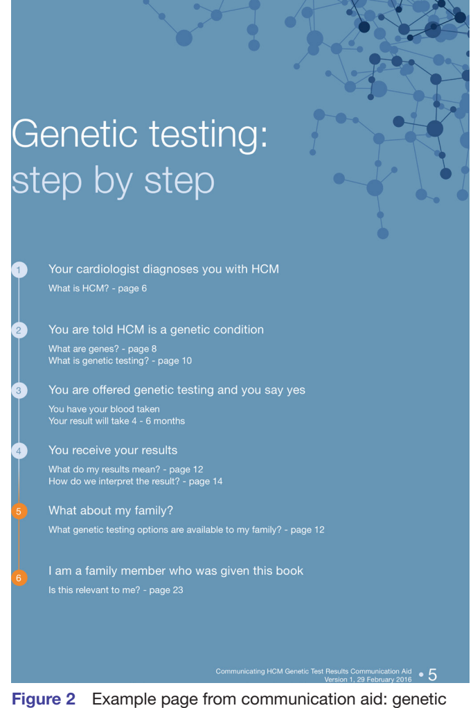
Figure 2 Example page from communication aid: genetic testing step by step. HCM, hypertrophic cardiomyopathy.

Overall, the literature highlights that probands require additional support to understand and communicate genetic results. The rationale for this study is the critical gap in supporting patients' comprehension and consequent communication of genetic risk to at-risk relatives. Though genetic counsellors are specifically trained in delivering genetic information, information