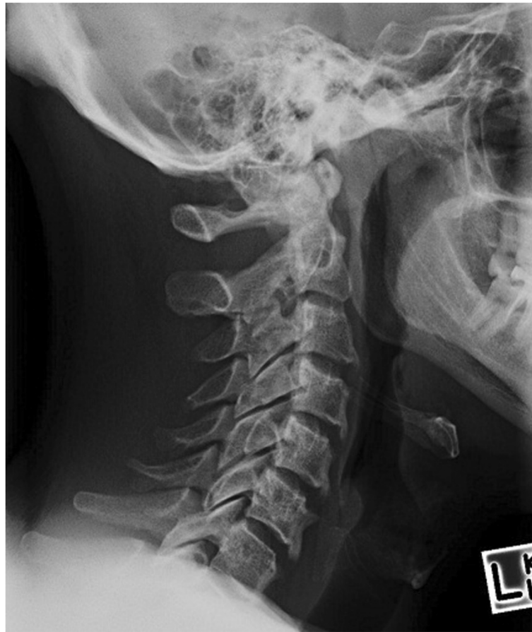
Figure 1 Lateral cervical spine X-RAY showing inferiorly-facing ossification along the C3-6 vertebral bodies.

-4.5 mg/kg) for longer periods (1–6 years) for non-acne indications.