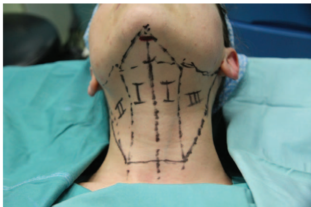
Fig. 2. Preoperative neck area design for treatment.

The RFAL delivers radiofrequency converted into heat, estimated in kilojoules. The mean amount of energy delivered was 4.5 kJ per procedure (2–8.5 kJ).