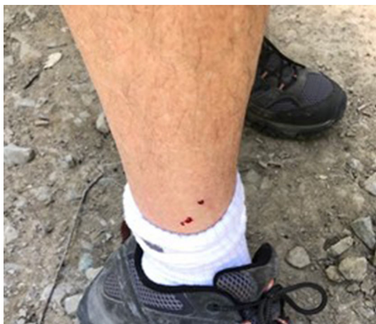
Fig. 1 Rattlesnake bite. Post-bite puncture wounds on the anterolateral right lower extremity