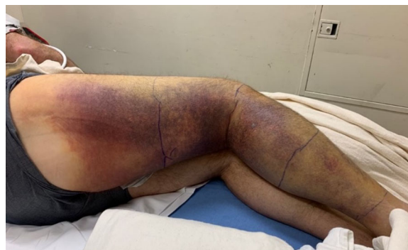
Fig. 2 Right lower extremity on presentation. The extensive edema and ecchymosis present highlight the tremendous vascular injury inducible from Crotaline envenomation

A 62-year-old male presented to a local hospital 1 h after sustaining a Northern Pacific rattlesnake bite to his right anterolateral shin while he was hiking in Marin County, California (Fig. 1). On arrival, he noted an onset of limb dysesthesia and perioral numbness, the latter of which resolved with administration of six vials of ovine Crotalidae -polyvalent immune fab (CroFab). Over the ensuing 24 h, he continued to experience dysesthesia as well as edema and ecchymosis surrounding the site of envenomation. Lower extremity ultrasonography revealed no evidence of deep vein thrombosis. He was observed a second night and discharged home after a total of 36 h with stable right lower extremity dysesthesia, edema, and ecchymosis. Four days later, he presented to the emergency department at our hospital with progressive dyspnea on exertion, lightheadedness, and worsening right lower extremity pain and edema. He was afebrile with a heart rate of 78 beats per minute and blood pressure of 145/68 mmHg. On physical examination, he was in no apparent respiratory distress on room air yet exhibited marked right lower extremity edema with ecchymosis and associated tenderness to palpation extending from the proximal thigh to the foot (Fig. 2). Range of motion of his knee and ankle was limited by edema, sensation