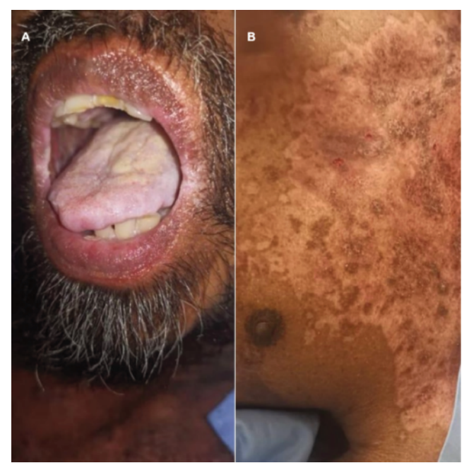
Figure 3. Patient at 2-4 weeks post-treatment. A) Improvement of the lips, and tongue; B) improvement in the chest area.