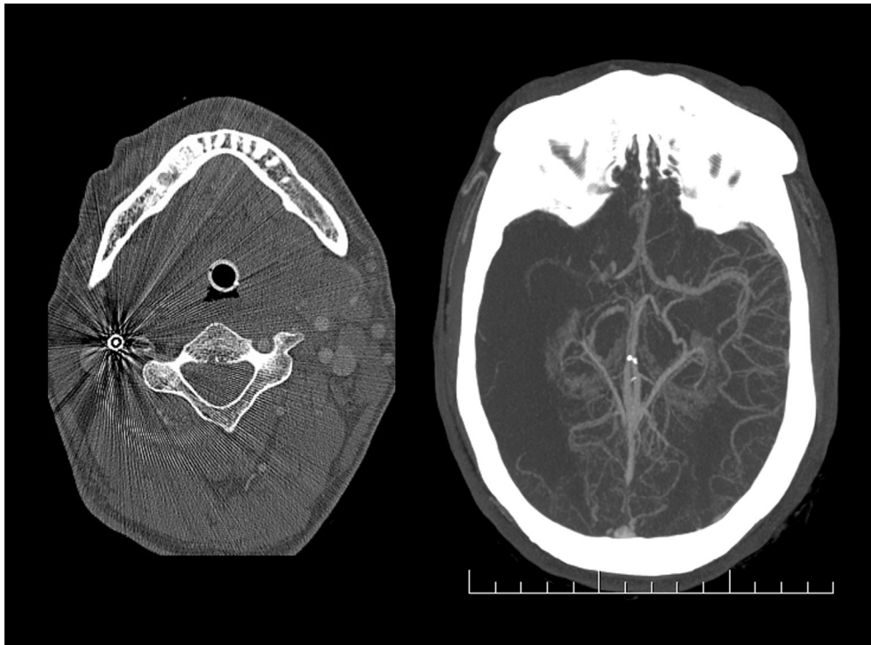
Figure 1. Computed tomography angiogram of the head and neck obtained five hours after the injury. The image shows a pellet wedged in the lumen of the right internal carotid artery approximately 2 cm above the bifurcation (at the C2/C3 level), and a filling defect in the right middle cerebral and right internal carotid arteries distal to the pellet (right).

without vasopressor support. There was a small non-bleeding wound 5 cm below the centre of the left clavicle as the only indication of trauma. Neurological examination was limited by sedation. Under general anaesthesia with single lung ventilation, the entry point was examined via a left anterolateral thoracotomy. Besides the lung penetration, complicated by haemothorax (1000 mL), a pericardial wound with left ventricular penetration was revealed. However, no pellet was found.