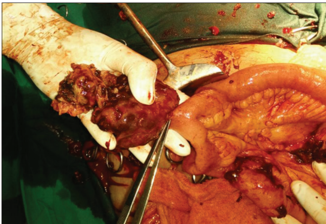
Figure 1: The intraoperative view showing tumor arising from the terminal ileum

There are no standard treatment guidelines for the treatment of IDCS owing to its rarity. IDCS is treated with surgical excision, radiotherapy, chemotherapy, or a combination of these therapies. In localized IDCS, surgical resection is the main stay of the treatment. Adjuvant radiotherapy has shown to prolong disease survival rates in some studies. [6,7] Most of the advanced cases, which survived for several years, were treated with chemotherapy and/or radiation therapy. [4] Several chemotherapeutic agents have been tried, including cyclophosphamide, doxorubicin, vincristine, and prednisolone; doxorubicin, bleomycin, vinblastine, and dacarbazine; dexamethasone, cisplatin, and high-dose cytarabine; and ifosfamide, carboplatin, and etoposide. [6,7] In our case, the patient was advised chemotherapy but he refused citing age as a factor. After 6-month follow-up, there was no recurrence and the patient was planned for the restoration of intestinal continuity.