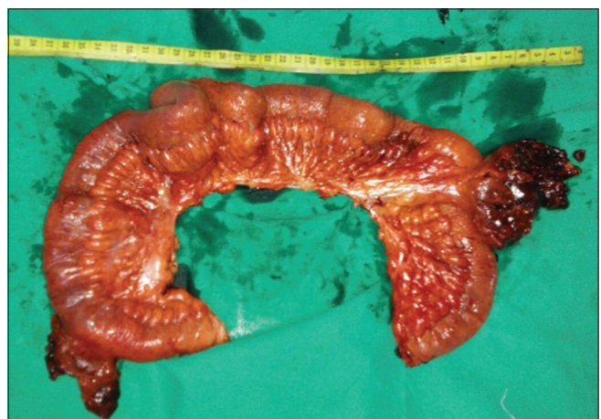
Figure 2: Resected part of the ileum showing friable mass