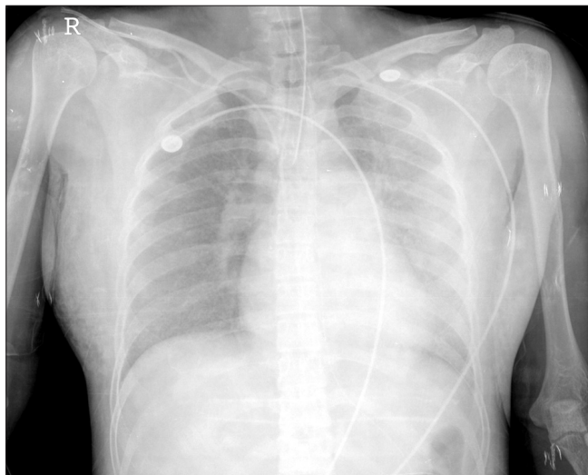
Figure 1. The plain chest radiography shows ground glass opacity and consolidation in both lung fields.

The patient was admitted to the intensive care unit and treated with mechanical ventilation owing to worsening hypoxemia. After several days, hemorrhagic eruptions occurred in anterior chest area. She was initially administered antibiotics, corticosteroids and diuretics. Hypoxemia was gradually improved. After 5 days, the result of initial blood culture showed no growth and there was no evidence of fever. Therefore, we could exclude the septic embolism and discontinued the antibiotics. She was weaned from mechanical ventilation. At the eighth day of hospital admission, she was discharged. After one month, she was completely improved and follow-up chest CT showed improvement of the previous pulmonary lesion without fibrosis (Figure 3).