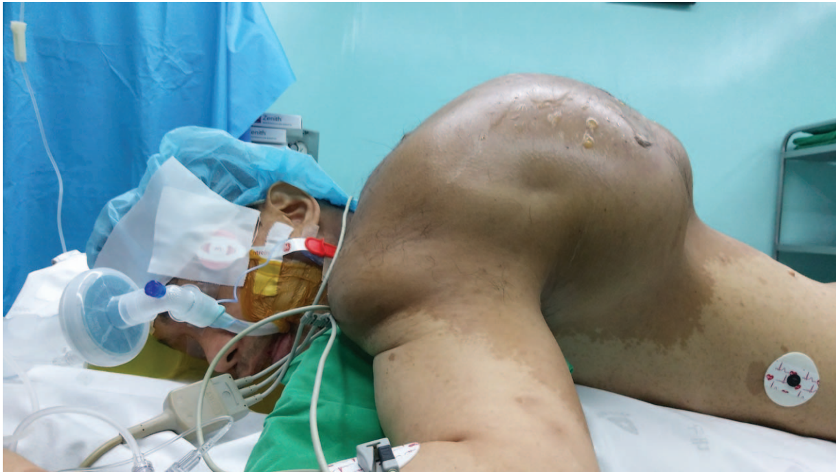
Figure 4. The patient placed in a prone position for hematoma removal.

endotracheal intubation. Before instigating the position, the head should be oriented neutrally (no lateral bending or rotation of the head). A supine position permits both a neutral head orientation and a sniffing head position. Regrettably, the present patient was in LDP because he could not be placed in a supine position due to pain derived from an upper back mass. Thus, a pad was placed below the dependent side of the head to orient the head in a neutral position and then achieve a sniffing position. However, an LMA was inserted instead of an endotracheal tube because only a sniffing position does not guarantee successful endotracheal intubation.