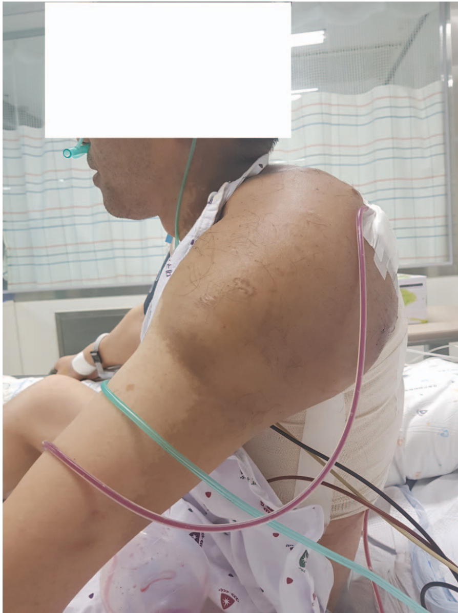
Figure 5. The conscious patient in a sitting position after removal of the hematoma.

incompetence in manipulating the bronchoscope might delay endotracheal intubation causing hypoxia in patients with neuromuscular blockade under general anesthesia. Therefore, the general use of fiberoptic bronchoscope should be limited in LDP. In addition, light-wand and intubating LMA also can be used for endotracheal intubation. However, esophageal intubation cannot be completely avoided. [3,7]