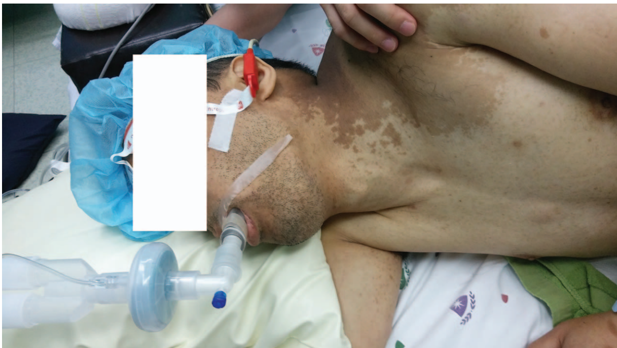
Figure 2. The non-inflatable laryngeal mask airway (size 4 i-gel TM , Intersurgical Ltd., Wokingham, Berkshire, UK) inserted into the patient placed in a right lateral decubitus position.

At the conclusion of the LMA insertion the patient was placed in a supine position. Pads and pillows were placed behind the head and the body trunk below the mass in order that the mass not be compressed while he was in the supine position (Fig. 3). After the LMA was removed from the mouth, the trachea was intubated with a 7.5-mm internal diameter cuffed reinforced endotracheal tube using a portable videolaryngoscope (UEScope, UE Medical Devices Inc., Newton, MA). The capnographic waveform confirmed the placement of the tube into the airway. Auscultation of breath sounds in both lungs ruled out