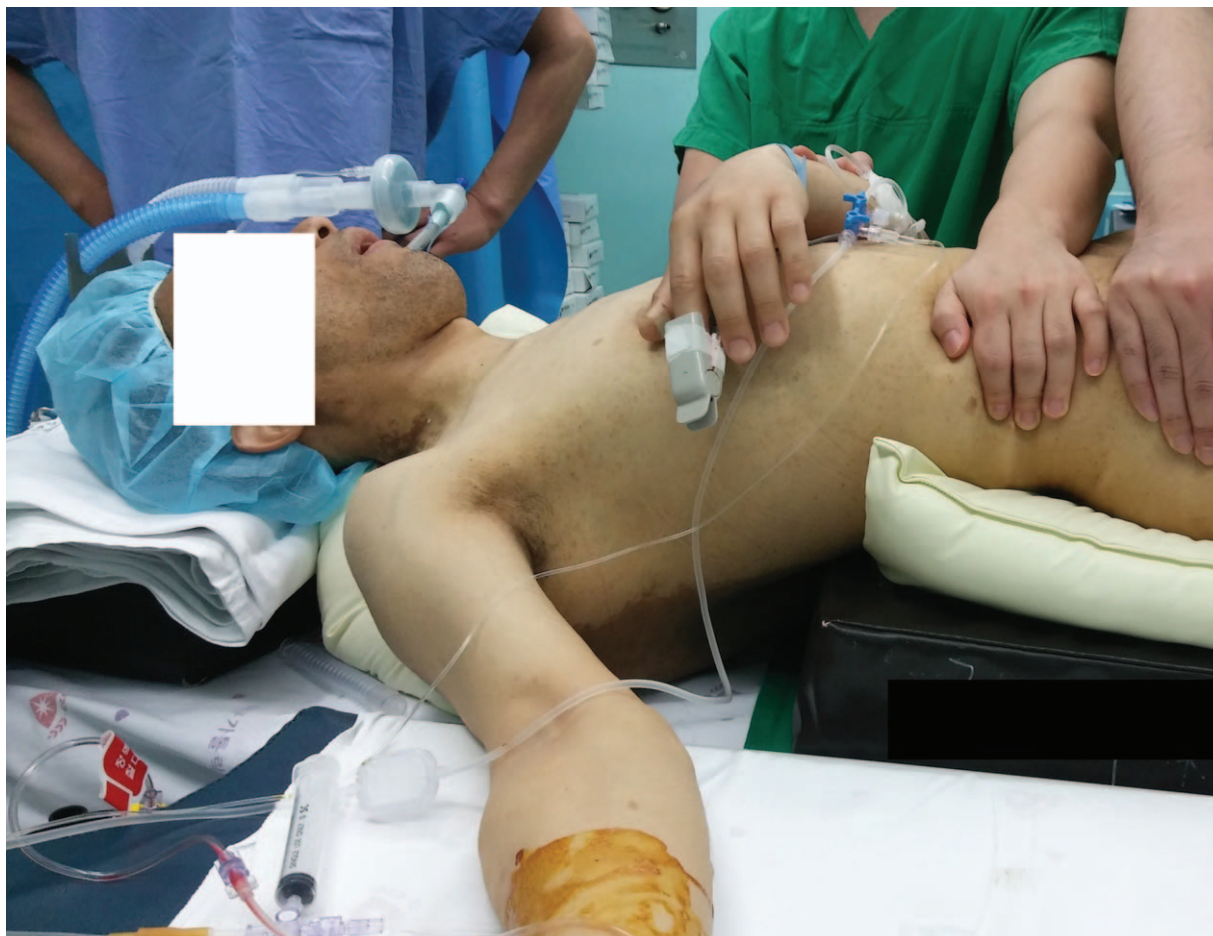
Figure 3. The patient placed in a supine position with pillows and pads applied to protect the mass from compression between the patient's body and the operating table. The patient was intubated after removal of the laryngeal mask airway.

endobronchial placement of the tube. Mechanical ventilation was maintained as described above. Under ultrasound guidance the right internal jugular vein was catheterized to administer blood products and fluids and to monitor central venous pressure continuously. The patient was then placed in a prone position with the head turned to the left (Fig. 4).