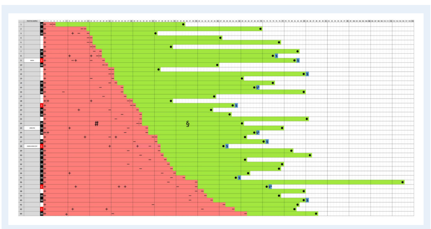
Figure 2. Timeline in days of the period between the first positive nasopharyngeal swab for COVID-19 and sample collection. Urine pre: urine collected before semen collection; urine post: urine collected after semen collection. Timeline (days) from first positive nasopharyngeal swab for COVID-19 and the sample collection for each patient. In the first column, the origin of the samples is reported. White box: not hospitalized patient; 'H': patient hospitalized in medicine units; 'I': patient hospitalized in intensive care unit. Red squares indicate the period between the first positive nasopharyngeal swab for COVID-19 and the second negative nasopharyngeal swab, while the green ones represent the period between the second negative nasopharyngeal swab and the date of sample collection. The symbols '+' and '-' indicate a positive or a negative nasopharyngeal swab result for SARS-CoV-2 RNA. 'S': azoospermic; 'S*': oligospermic; ●: sample collection time; #: median proven healing time: 31 days (range 3-65); §: median SARS-CoV-2-free time: 35 days (range: 24-43).

from COVID-19 have a significant risk of developing oligo-crypto-azoospermia.