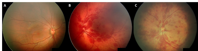
Figure 1 Wide-field digital images of retinal haemorrhages of newborn infants in UNES. (A) Isolated optic nerve haemorrhages, (B) extensive haemorrhages involving the optic nerve and macula and (C) extensive, white-centred haemorrhages involving the optic nerve, macula and periphery. UNES, universal newborn eye screening.

has been incorporated into many retinopathy of prematurity screening programmes worldwide with significant incidental findings of ocular abnormalities reported. 6–9