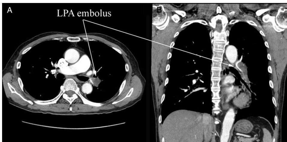
Figure 2: Preoperative CT. (A) Cross section and (B) coronary section. A large embolus stuck into the left pulmonary artery (LPA). The embolus formed acute angles with the vessel wall, which suggested an acute pulmonary embolism.