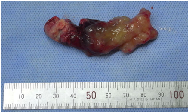
Figure 4: Gross appearance of the pulmonary tumor embolus. The size of the embolus was 64 × 20 mm. Although most of the embolus was soft and gelatinous, it was partly organized and solid.

In our case, the findings of preoperative chest CT and echocardiography suggested the occurrence of acute pulmonary