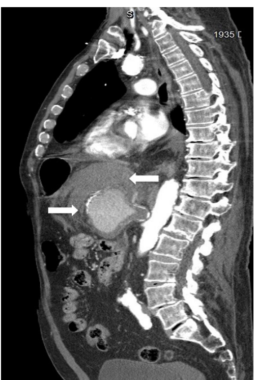
Image 1. Computed tomographic angiography of the chest and abdomen demonstrating active extravasation of the celiac artery and splenic artery aneurysm (rightward arrow) with extensive stranding (leftward arrow), representing active hemorrhage.

Within 30 minutes of arrival to our ED, the patient was in hypovolemic shock with hypotension (59/34 mmHg), tachycardia