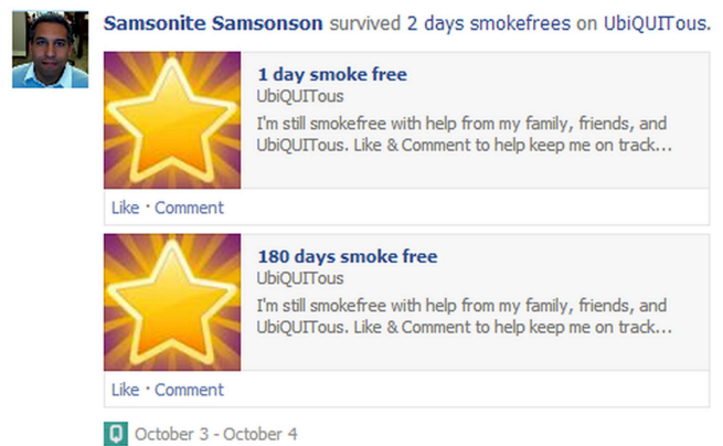
Figure 1 Facebook Timeline.

This study aims to identify the variables that drive adoption and dissemination of an intervention throughout a network. The study examines this question within Facebook, the single largest and fastest growing online social network. As of 2013, approximately 143 million Americans use Facebook daily, with users globally sharing an average of 4.7 billion items of content daily. 28 Facebook enables individuals to create a profile, identify other members who are friends, exchange messages through multiple channels and—most relevant to this study—install small applications ('apps') created by third parties. These apps rely on 'viral' diffusion to grow their user base, and achieve this by inducing users to