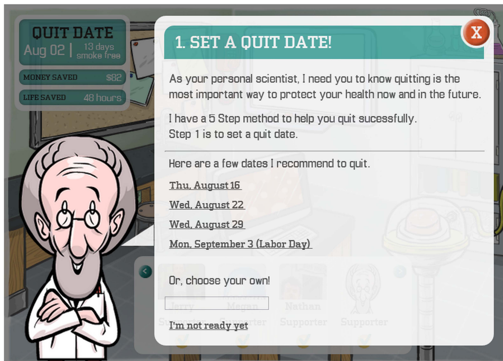
Figure 3 Application Quit Date Wizard.

as they nominate as buddies or with whom they actively communicate. 20–29 The app leverages this network phenomenon by manipulating sharing and competition-driven app use to drive contagion, both of which map