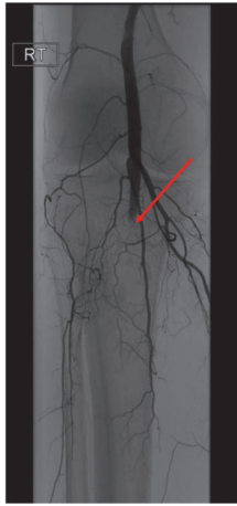
FIGURE 3: Right lower extremity angiogram demonstrating acute occlusion of the distal popliteal artery with no significant runoff vessels. A catheter was placed in this artery and Tissue Plasminogen Activator (TPA) was infused overnight. Subsequent evaluation revealed resolution of thrombus within the popliteal artery and tibioperoneal trunk.

the thrombocytopenia (25,000/mcl) he was experiencing because of his recent chemotherapy. After platelet transfusions to treat his thrombocytopenia, he underwent intra-arterial Tissue Plasminogen Activator (TPA) injection by Vascular Surgery to the right popliteal artery.