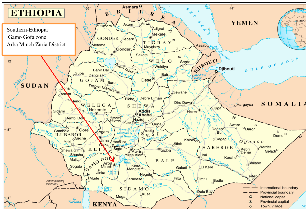
Figure 1 Map of Arba Minch Zuria district in Gamo Gofa zone, Southern Ethiopia.

mins at room temperature. Following this, the serum sample was separated into multiple Nunc tubes for each patient and then transported to Armauer Hansen Research Institute (AHRI) laboratory by liquid nitrogen cold-chain system for laboratory diagnosis. Moreover, the serum sample of each patient was screened for the presence/absence of WNV-specific IgG and WNV-specific IgM antibodies using indirect immunofluorescence test (IIFT) (EUROIMMUN AG, Luebeck, Germany) as per manufacture's protocol. Initially, serum was diluted to 1:10 with buffer and 30 \mu L of diluted serum added to each of the two reaction fields on a BIOCHIP slide. Each field contained two BIOCHIPS, one with WNV-infected cells and the other with uninfected cells and incubated at room temperature for 30 mins in the dark place. Then, cells were exposed to either 6 M urea solution or phosphate-buffered saline-Tween for 5 mins. After washing with phosphate-buffered saline-Tween, cells were incubated with fluorescein-labeled anti-human globulin for 30 mins and again washed with buffer. After drying, the slides were viewed at the 20x magnification objective of