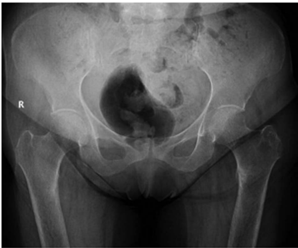
Figure 1. Preoperative antero-posterior pelvis view.

activity, especially upon weight bearing and was rated 7/10 using the Visual Analog Scale (VAS).