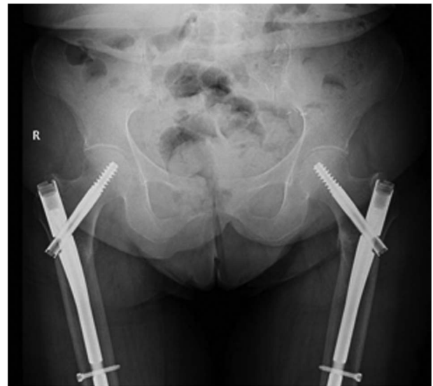
Figure 3. Postoperative antero-posterior pelvis view.

malabsorption and change in bone metabolism [11, 12]. Robert et al. demonstrated that the malabsorption risk related to the MGB-OAG procedure is higher than with other techniques [3]. While many studies attempted to explain causes for postoperative bone loss, decreased mechanical weight loading, hormonal changes, and calcium/vitamin D supplementation [13], the pathogenesis of insufficiency fractures following bariatric surgery is still poorly understood in comparison to those following long-term administration of bisphosphonates [8, 14].