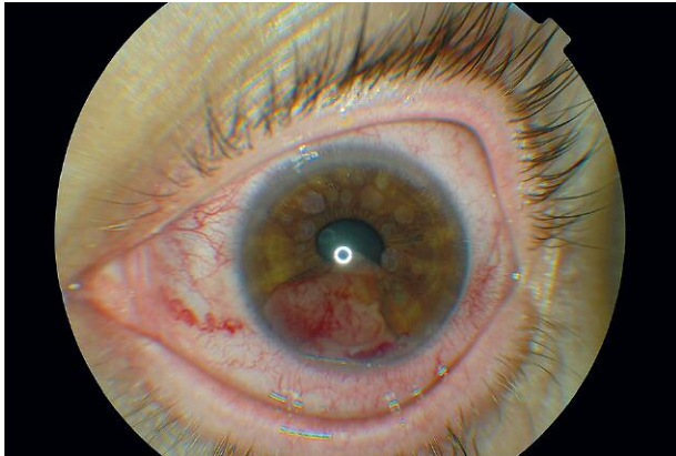
Fig. 1. The anterior segment examination revealed a tumor mass spread over the whole iris