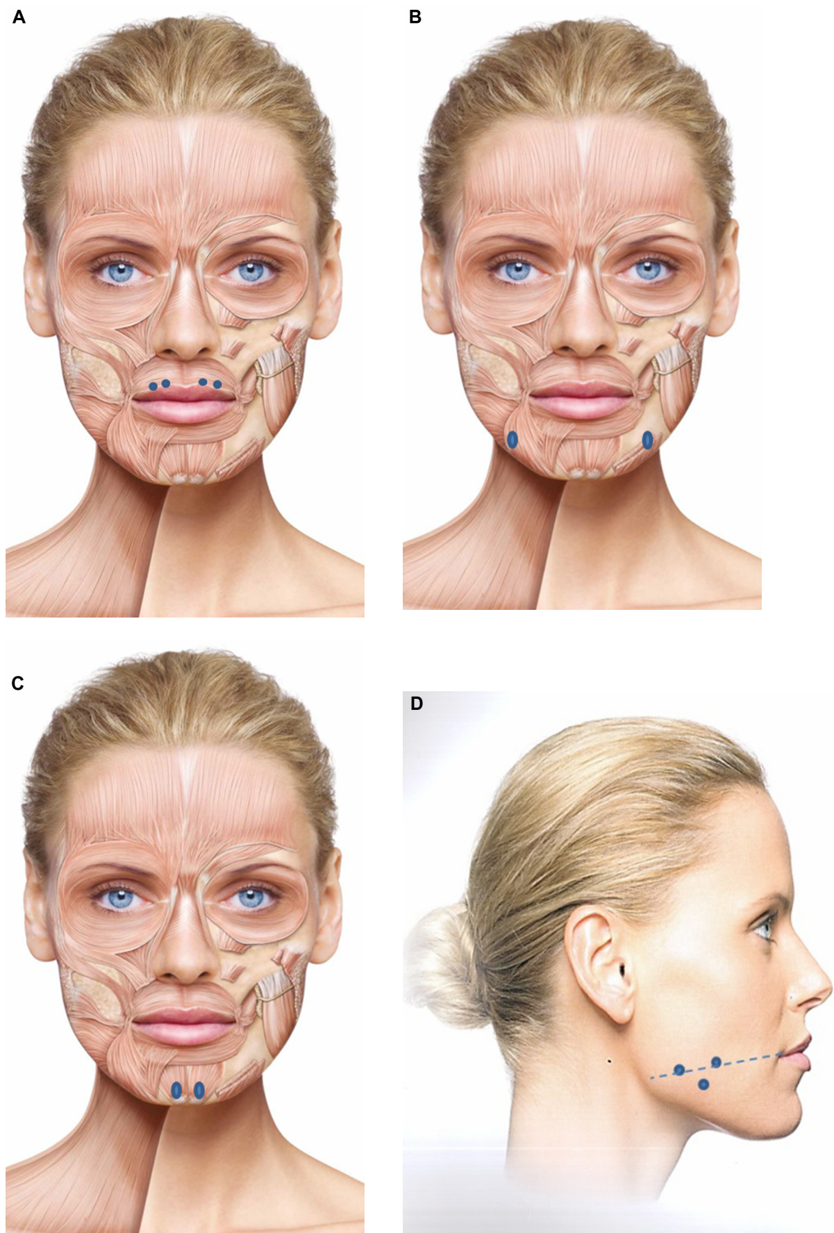
Figure 2 (Continued)