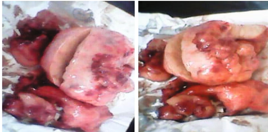
FIGURE 1: Ovarian tumor resected.