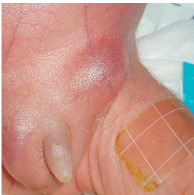
Fig. 1. A firm and enlarged 2×2 cm mass was observed in the left inguinal region.