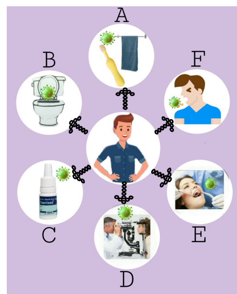
Fig. 1. Various ways for transmission of COVID-19. A: Personal necessity's function, B: Potential of fecal-oral and fecal-aerosol routes in transmitting SARS-CoV-2, C: Multiuse eyedrop bottles, D: Exposure of ophthalmologists to patients' exhaled droplets, E: Aerosol contamination in dental procedures, F: Respiratory droplets, or bioaerosols.

There are various ways in which respiratory tract infections may be transmitted from an infected individual to another person, including sneezing, coughing, talking, and breathing. Since respiratory droplets are expelled from the airways at high pressure and speed, the infected person can contaminate a large area of the surrounding air. An infected person can also enter the virus-carrying aerosols through their normal breathing, and these aerosols persist in the atmosphere for an extended duration. 16 The aerodynamic diameter of aerosols which varies from 0.3 to 100 \mu\text{m} can affect the distance they travel and the length of time they stay in the air. Aerosols with a diameter of >4.7 \mu\text{m} travel a limited distance, but droplets with a diameter of <4.7 \mu\text{m} travel a longer distance and stay in the air longer. Aerosols with a diameter of <10 \mu\text{m} are more infectious than other aerosols with larger sizes because they travel long distances, stay in the air longer, and easily enter the respiratory system through respiration. 17 However SARS-CoV-2 is mostly carried by aerosols with a diameter of smaller than 5 \mu\text{m} . The number of exhaled