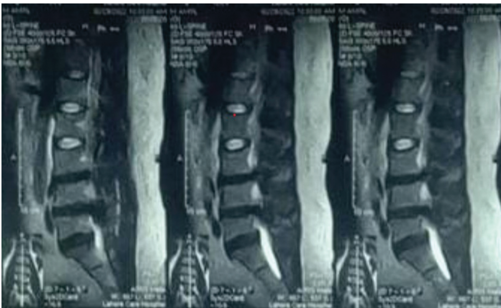
Fig. 1 Magnetic resonance imaging lumbosacral spine T2 sequence. Sagittal view showing lumbar stenosis most pronounced at L4/L5 and prolapsed intervertebral discs at L3-L4 and L5-S1.

A 34-year-old male presented due to our neurosurgery department with a long-standing history of lower back pain, which began radiating bilaterally to his lower limbs over the last 4 months. His condition had deteriorated further over the last 10 days with increasing pain, restricted straight left leg raising ability, and numbness at the L5 dermatomal territory in his left foot. Power was 5/5 (Medical Research Council scale) bilaterally, and reflexes were mildly brisk. An magnetic resonance imaging of the lumbosacral spine revealed lumbar stenosis most pronounced at L4/L5 and disc bulges at L3/L4 and L5/S1 (–Figs. 1 and 2). His visual analogue pain score (VAS) was now 6. The patient was a police officer whose symptoms now severely hindered his job, causing time off and stress, significantly impairing his