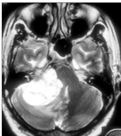
Figure 1: Magnetic resonance imaging brain (T2-weighted image) showing the right cerebello pontine angle tumor

Intraoperatively, anesthesia was maintained using air, oxygen (FiO 2 0.6) and isoflurane, and vecuronium infusion. Intermittent bolus doses of fentanyl and intravenous