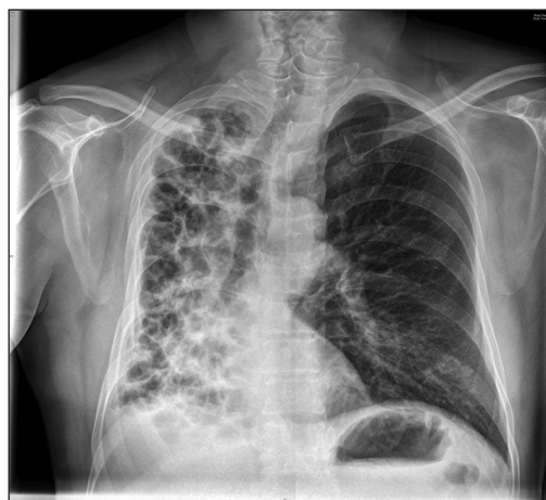
Figure 2: Preoperative chest X-ray showing bronchiectasis and fibrosis involving the right lung with the shift of mediastinum to the right