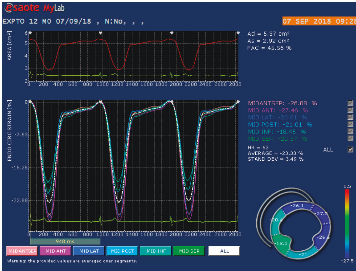
FIGURE 1: Representative 2D echocardiographic image obtained from a healthy dog providing a right parasternal short-axis view of the left ventricle at the level of the papillary muscles in which there is a region of interest drawn by the software that has been adjusted manually. The myocardium has been automatically divided into 6 segments for strain analysis: anterior, anterolateral, inferolateral, inferior, inferoseptal, and anterosseptal. The bottom panel provides color-coded circumferential strain curves for each of the 6 segments and a global strain curve (dotted white line), with strain value on the y-axis and time in seconds on the x-axis. Strain values for each segment are indicated and represent the corresponding percentage.

dynamics. Despite being considered safe from a cardiovascular point of view, opioids when combined with other drugs can cause significant changes in cardiovascular function, especially when associated with volatile anesthetics [16]. However, this study demonstrated that in addition to the known advantages of nalbuphine compared to other opioid drugs, like its minimal depressant effect on respiratory function, there is no influence of the drug on left ventricular function of healthy dogs, which renders nalbuphine a safe choice from a cardiovascular standpoint.