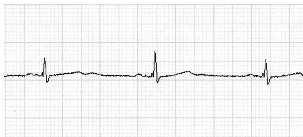
Figure 2 ECG after conversion: sinus rhythm of 52 beats/min.

In 2012 the recurrence of AF was resistant to the therapeutic measures that had proved effective since 2006. Given his comorbid condition, our intention was to avoid amiodarone and instead opt for catheter ablation, which had developed into a common and effective treatment in recent years. The restoration of the shape of the LV upon conversion to SR was an important argument by the electrophysiological team of clinic D to accept this patient for the ablation procedure. In the preparation of the catheter ablation an MRI showed a thoracoabdominal aneurysm. Although correction of the aneurysm and ablation was planned in one procedure in clinic E, the surgical intervention was restricted to the aneurysm because it proved to be too extensive. The postoperative course was delayed due to difficulties in weaning the patient off artificial ventilation given the existing pulmonary weakness. Incidentally, the surgeon in charge of the procedure reported that pulmonary function was abnormal upon thoracotomy: the lungs showed no collapse under pressure changes to the chest cavity but required manual assistance to be held aside as 'big rigid sacs'.