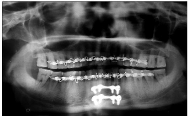
Figure 2: Open reduction and fixation done after arch bar fixation

The method used for the placement of Erich arch bar is as follows.