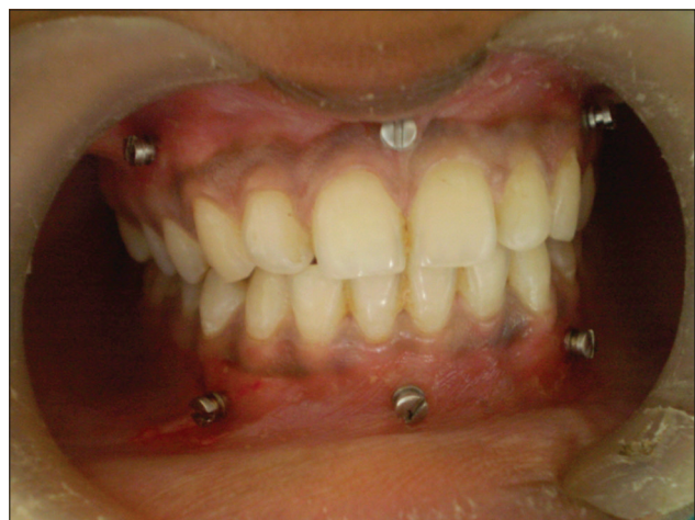
Figure 3: Intermaxillary fixation screws in position