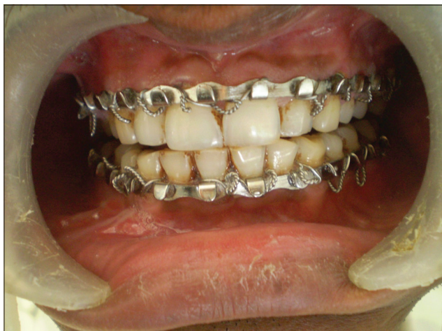
Figure 1: Arch bar fixation done

In our study, a comparison was made regarding the advantages and disadvantages of IMF screws over arch bars and also to record the incidence of complications with both techniques.