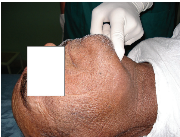
Figure 2 Compliant submental tissue. Negative submental sign.