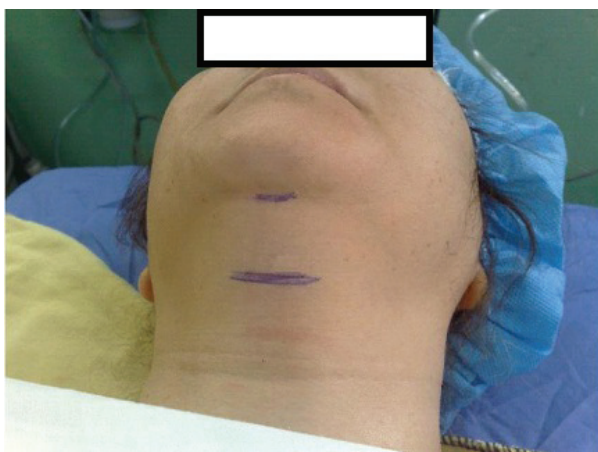
Figure 3 A bulky submental tissue (type A).