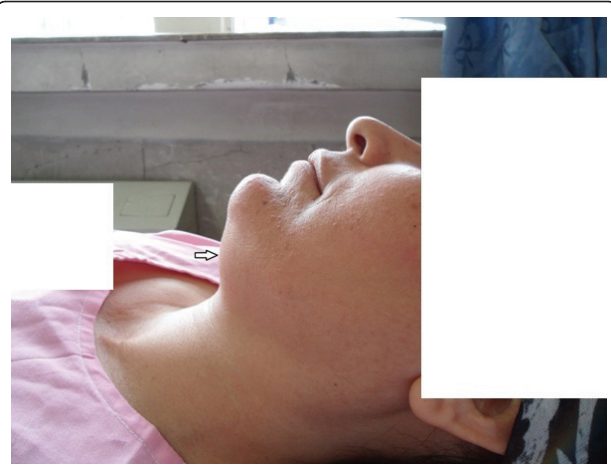
Figure 4 A bulky bulged submental tissue (type B).

assess submandibular compliance but it has been evaluated as having limited value to predict difficult laryngoscopy [12] on the other hand submandibular compliance has been mentioned for airway assessment. [13]